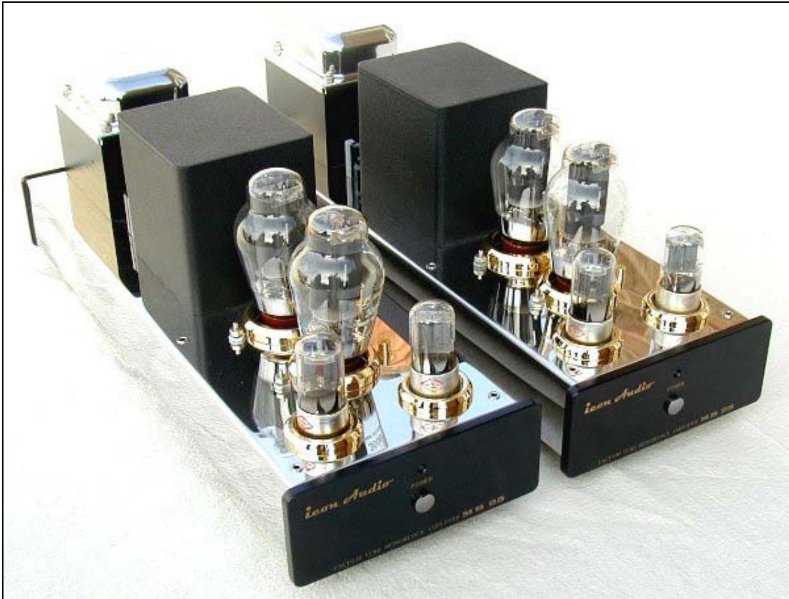
Shown here without the supplied attractive covers