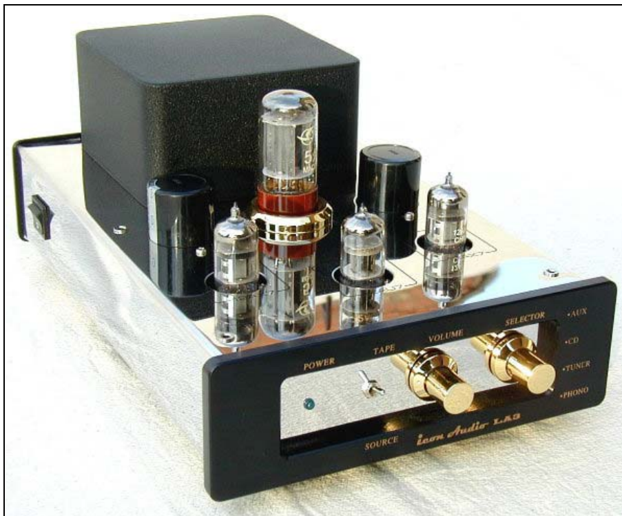
Shown here without the supplied attractive cover. Illustrated on page 2.